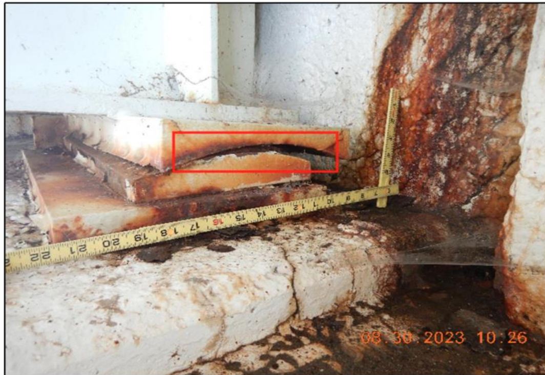
23. South Abutment, Bearing 1 - Gap Between Rocker and Sole Plate

BRIDGE NO. CE0041001 - GLEBE RD OVER SCOTCHMAN CREEK