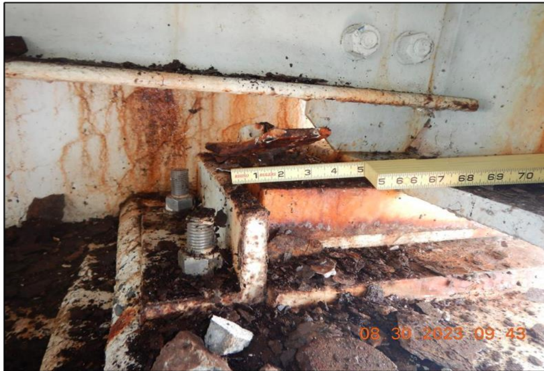
19. North Abutment, Bearing 4 - Sheared West Anchor Bolt

BRIDGE NO. CE0041001 - GLEBE RD OVER SCOTCHMAN CREEK