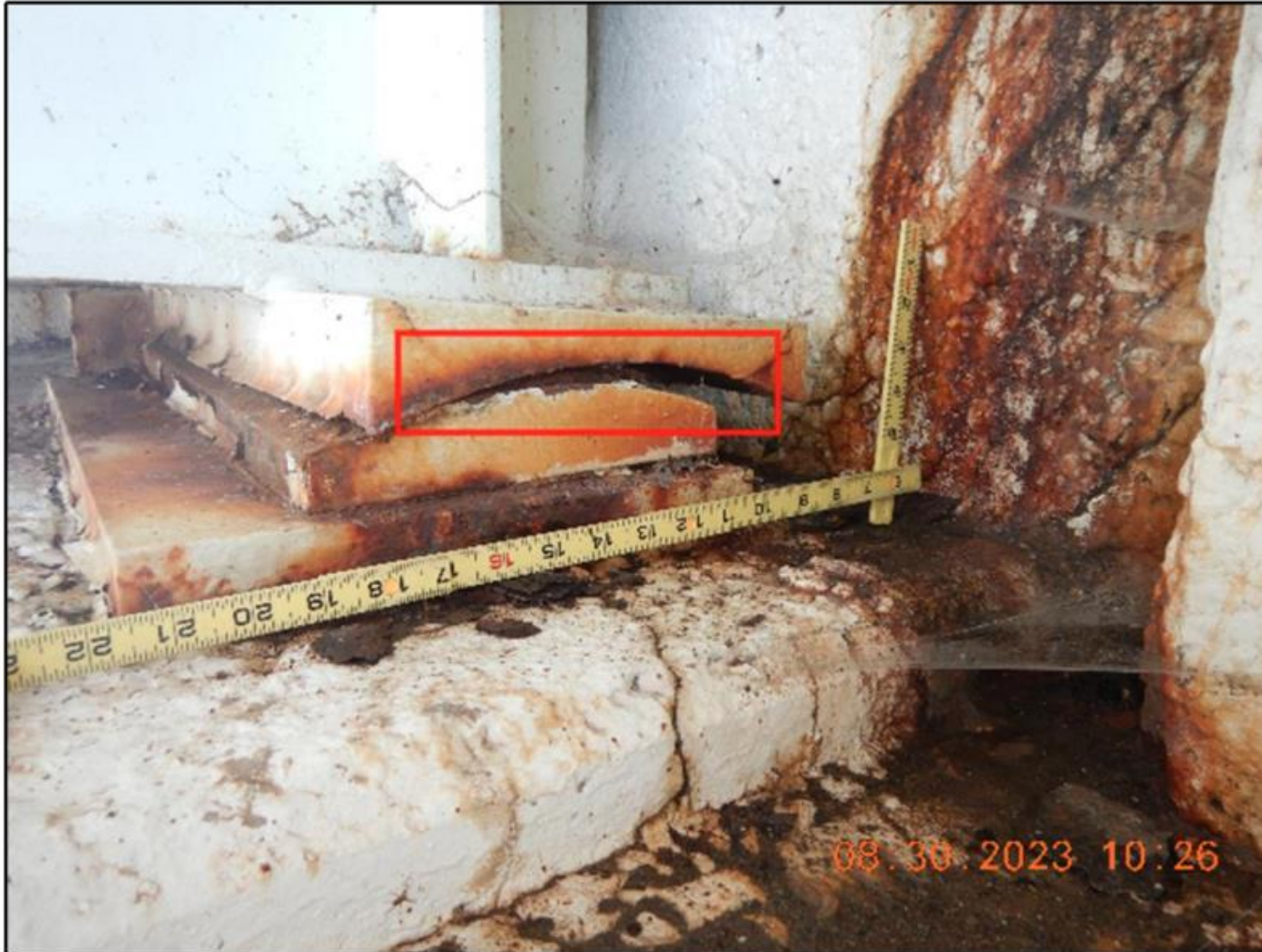
23. South Abutment, Bearing 1 - Gap Between Rocker and Sole Plate

Cecil County – Glebe Road Bridge Over Scotchman Creek CE0041